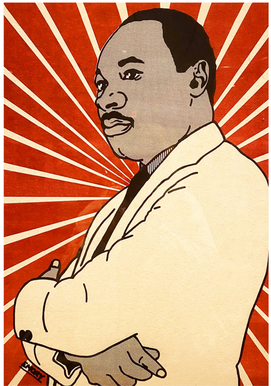
Emory Douglas, Portrait of Dr. Martin Luther King Jr. , 1993, print on paper, at Norman Rockwell Museum.

Racial stereotypes are created from the building blocks of fear and greed. When early settlers were confronted with the plentiful tribes of Native Americans, they immediately set to describing the differences between the two races in numerous illustrations. For the most part, they are depicted as strong and courageous, or devious and murderous. This distortion of reality also applied to depictions of slaves, and later, freed